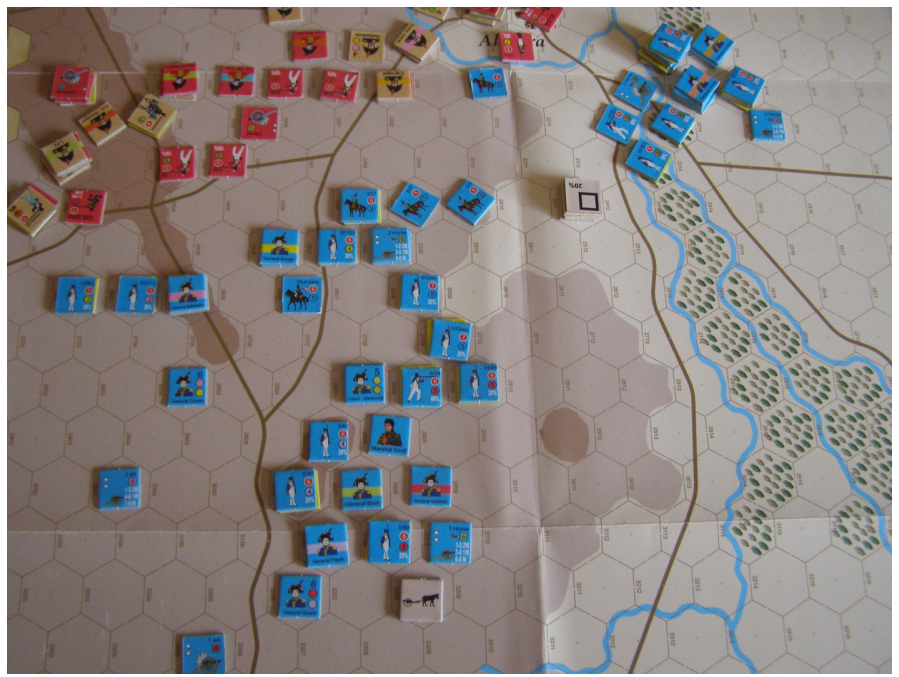
Both sides suffered heavy losses due to bad luck when checking morale as a result of enemy movement.