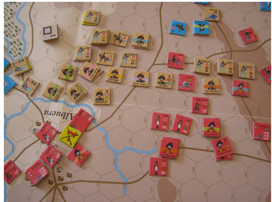
British center. Allied player had 4 Victory Points.