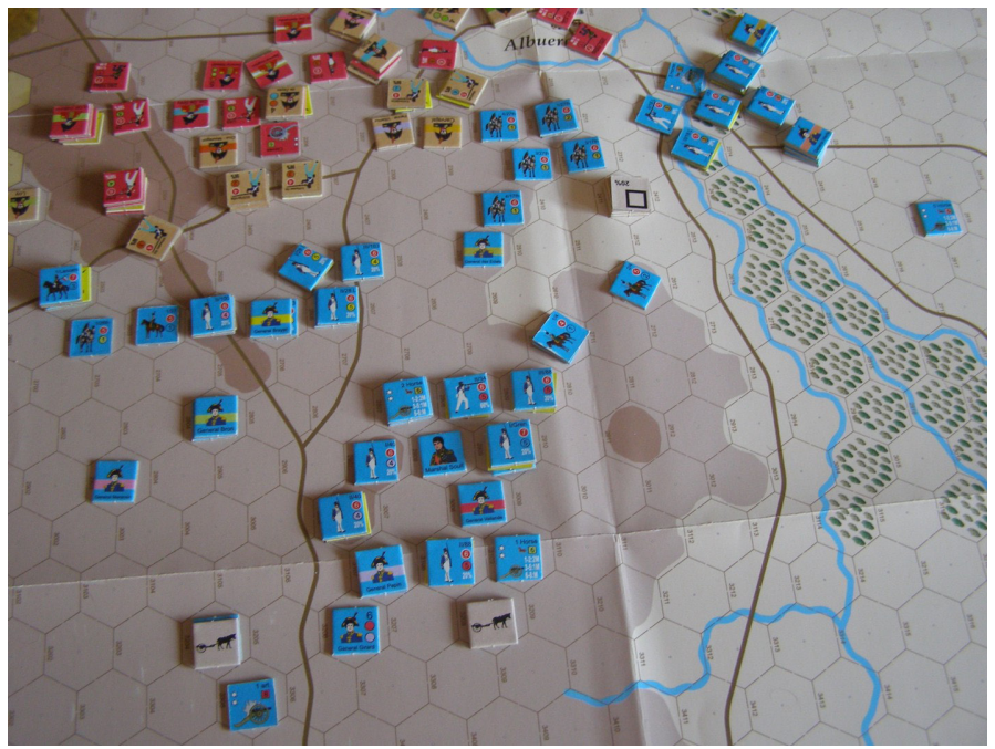
Bold charge of French cavalry caused many routs of Spanish infantry and British cavalry. French limbered artillery were trying to catch up with advancing line.