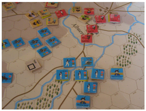
Decimated by artillery fire (performed by Sympher battery) Godinot's soldiers were supported by fresh troops from Werle's brigade. A shown square was formed by three Spanish battalions. The square was omitted by French cavalry commanded by brave General des Eclates. 3 Horse battery was now in French hands.