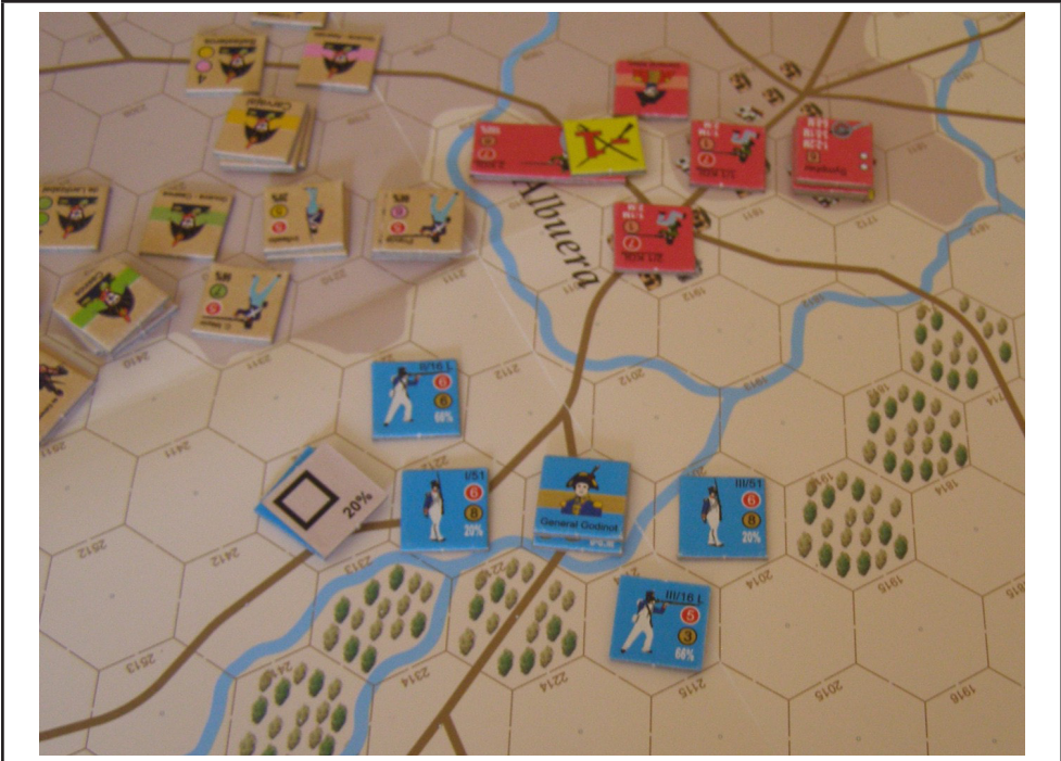
During Game Turn 2 each army lost one artillery battery.