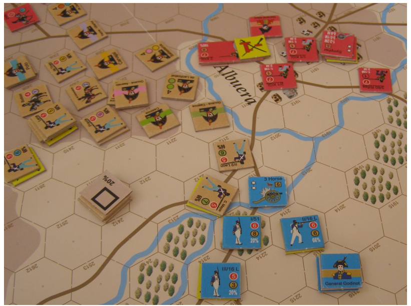
Troops of General Godinot suffered heavy from artillery fire by Sympner battery located in Albuera village. 3 Horse artillery was captured by Spanish soldiers.