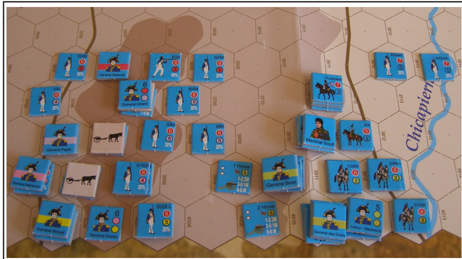
French main striking force.