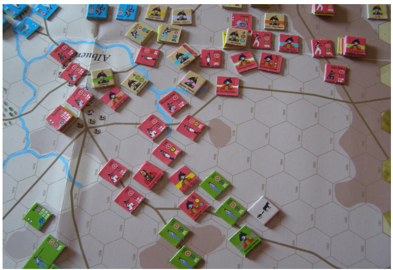
Coalition battle line was formed by commanders. Their troops were routed, mostly by reaction on French cavalry movement. French player had 5 Victory Points.