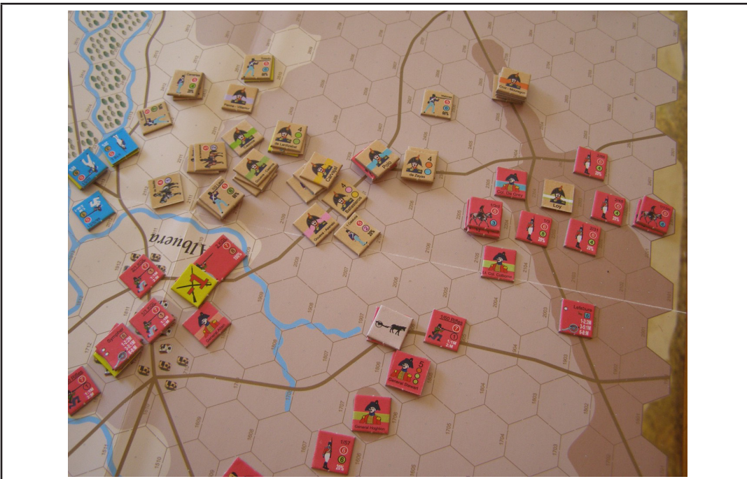
British infantry formed second line behind shattered Spaniards.