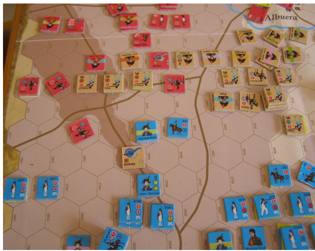
French cavalry commanded by General Bron captured batteries of Miranda and Cleves and routed British Colborne's infantry brigade. Bold counterattack by British cavalry retook Cleves battery and inflicted heavy casualties to French cavalry.