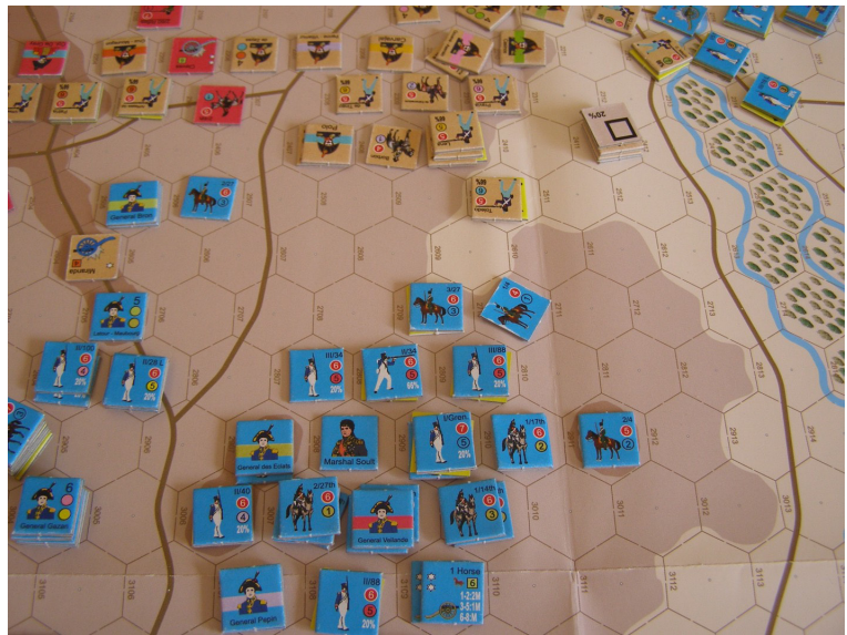
French center was ready for next push.