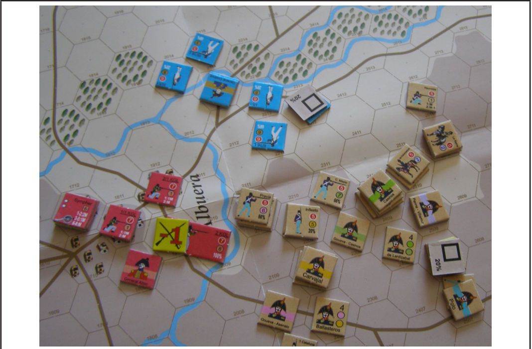
2 art. (under counter of General Godinot) was also in danger because it was not accompanied by other unit.