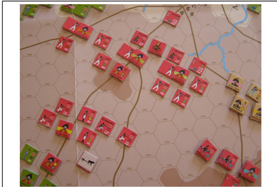
Center of the Coalition army.