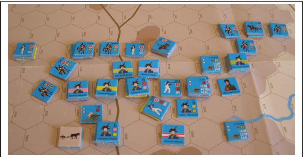
French troops regained lost artillery batteries. Lancers clear attack path for French infantry, but at high cost.