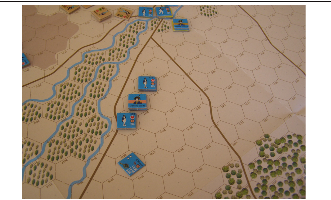
General Werle was moving fast to support Godinot's depleted brigade.