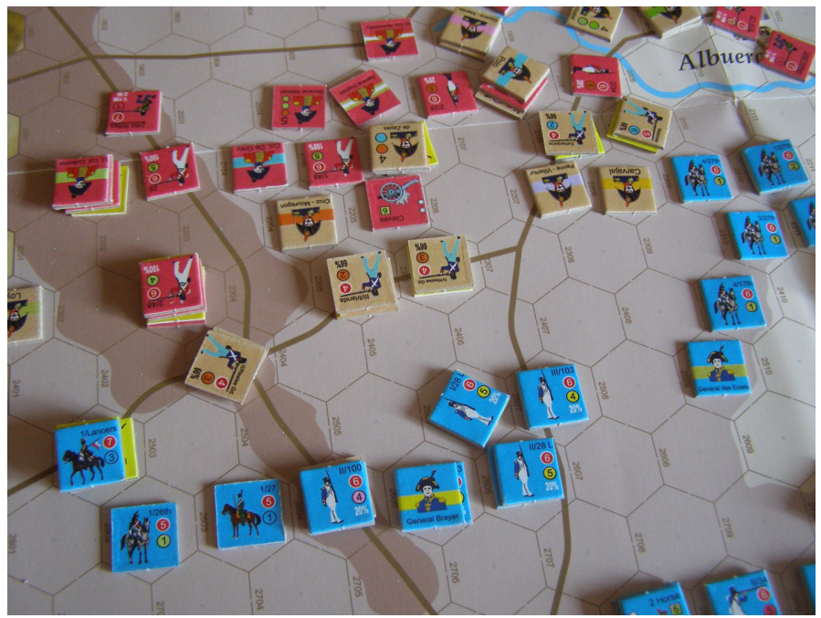
Captured Spanish Miranda battery is secured by French 100 line regiment. 1/26th was the only surviving squadron of Bron's cavalry brigade.