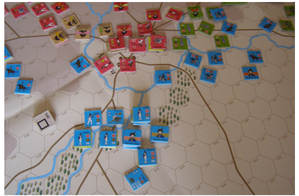
General Werle supported remnants of Godinot's brigade. Fresh battalions were quickly under heavy artillery fire from Sympher's battery.