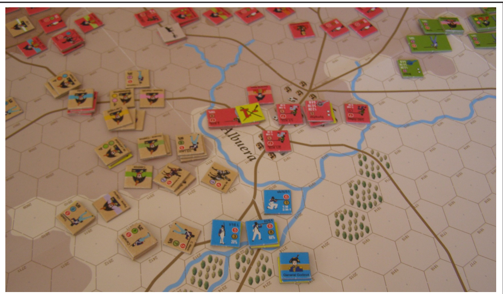
Albuera village is firmly held by British infantry with strong support of majority of Spanish forces.