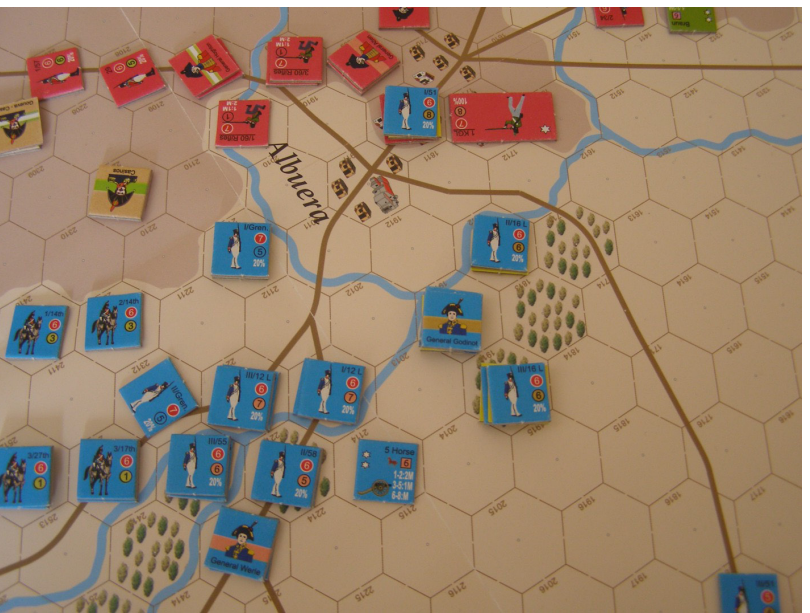
Moreover, brigades of Generals Werle and Godinot attacked Albuera and captured British Sympher battery in Albuera village.