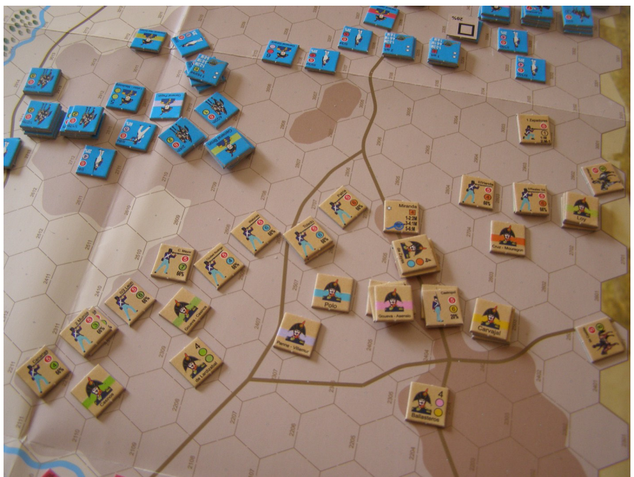
which was formed by brave Spanish soldiers.