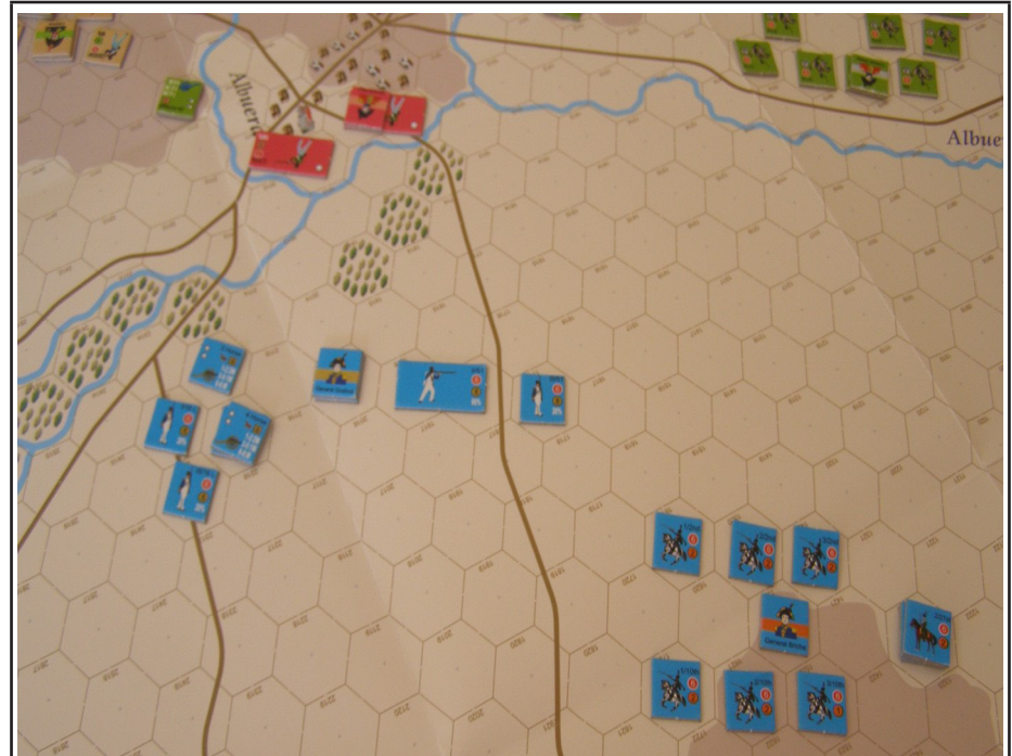
Godinot's brigade is ready to attack the Albuera village.