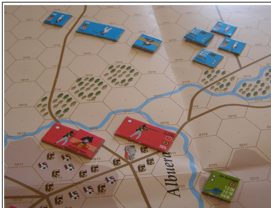
British defenders of the village.