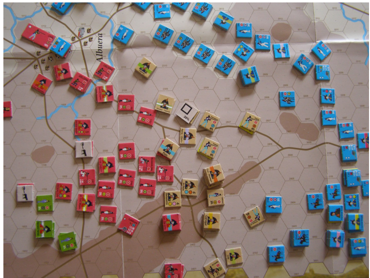
French cavalry bravely moved towards Spanish infantry. Unsuccessful reaction on enemy movement caused many routs of Spanish troops. British units were close, but not enough to effectively support Spanish infantry.