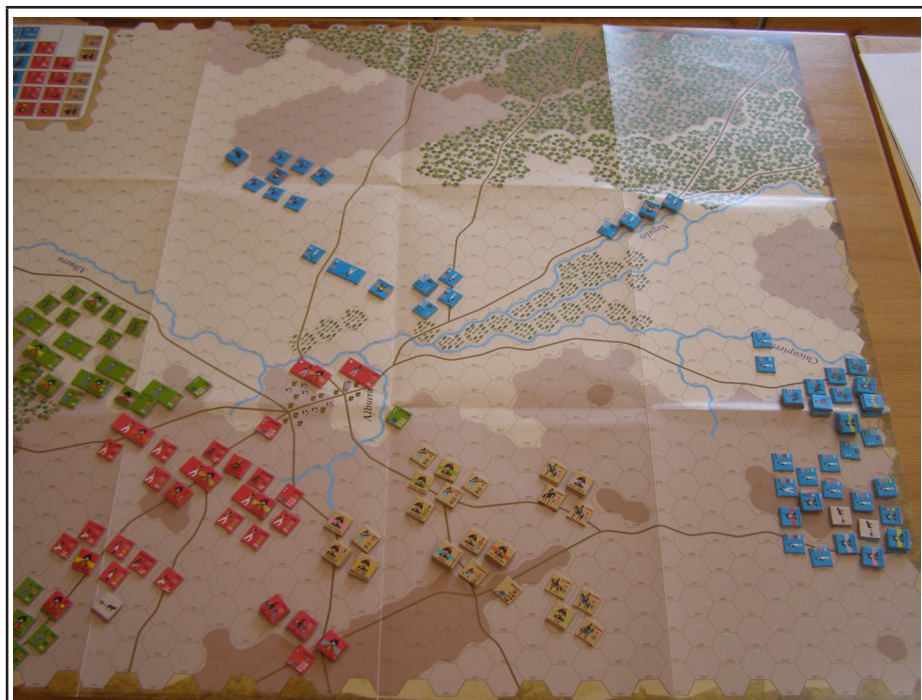
Overall view of the battlefield.