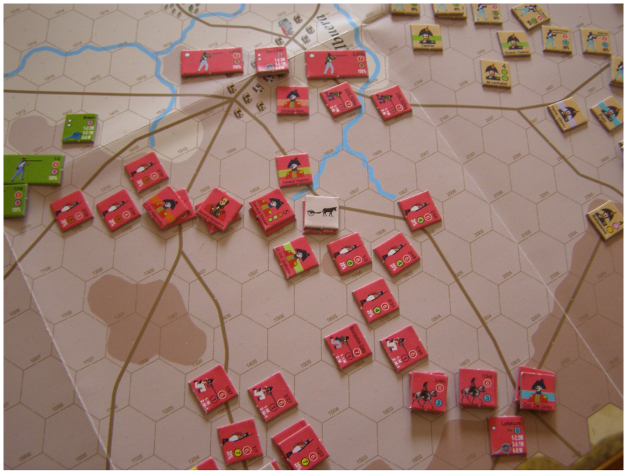
British units started movement to reinforce their right wing,