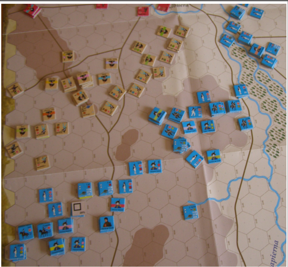
French army slowly but steady advanced towards Spanish line.