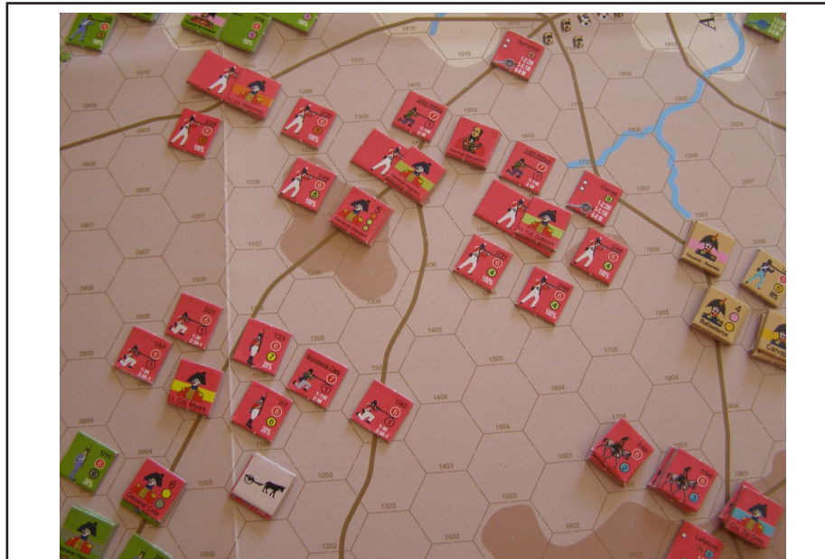
Center of the Coalition army.