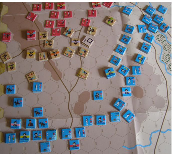
During this Game Turn the French player used quality and numerical superiority of his artillery. The lone Spanish battery (Miranda) was quickly destroyed by artillery fire.