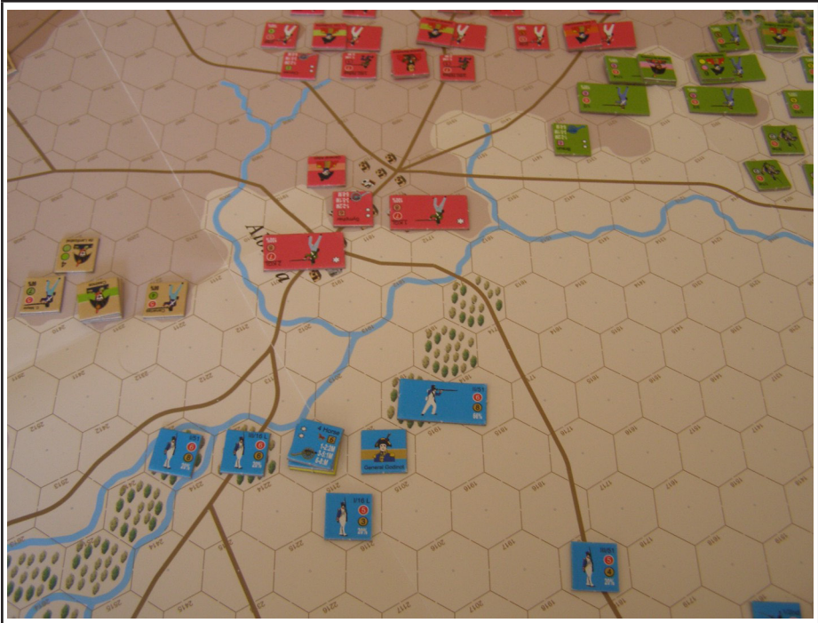
In artillery duel both sides lost one battery each.