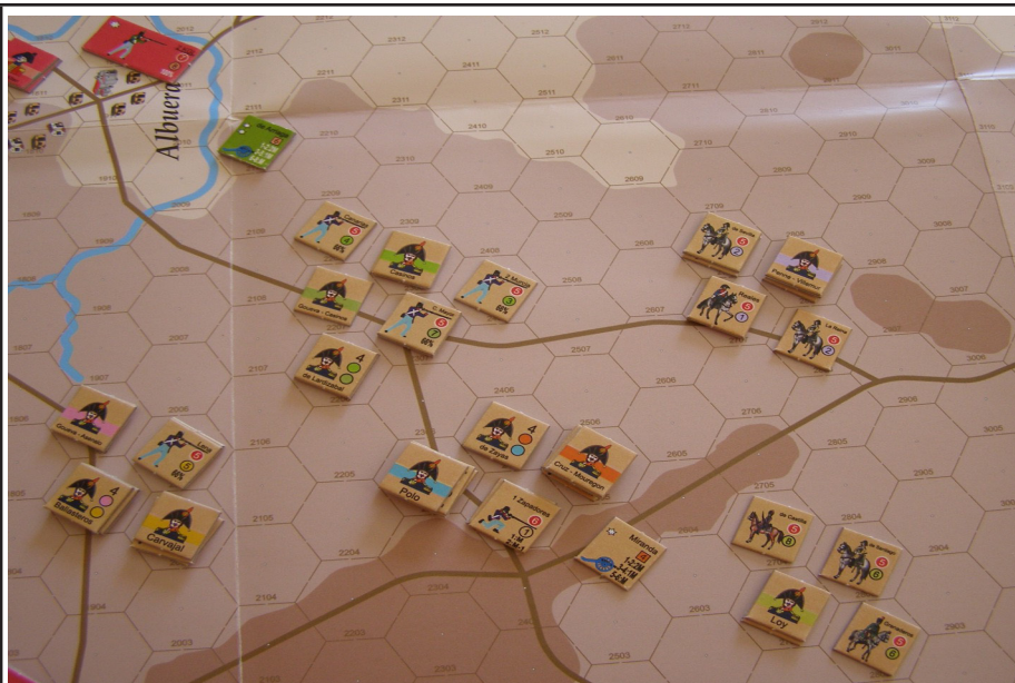
First to fight - Spanish divisions on the right wing.