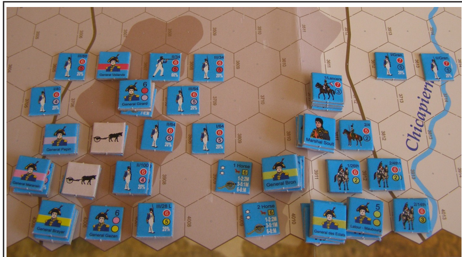
French main striking force.