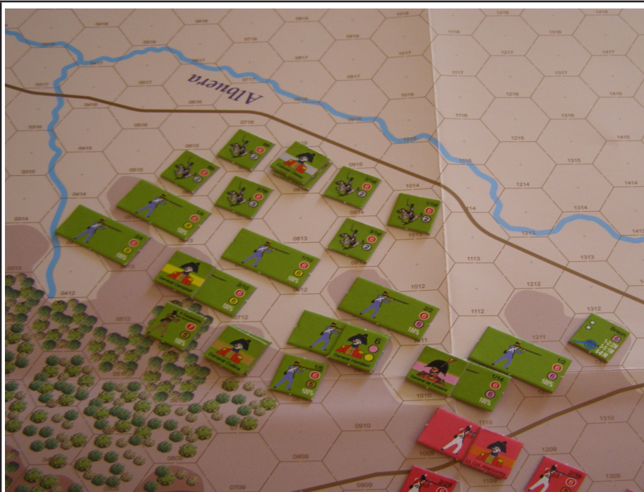
Relatively quiet left wing of Coalition army.